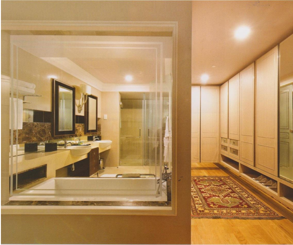
The true sign of luxury? Having a walk-in wardrobe near the bathroom to offer greater ease for when you need to glam up.

99 private and exclusive accommodation units. Fashioned along the lines of a resort but built within the hustle and bustle of the city, residents will have everything they need almost at their door step. A spa treat after a hectic day at work, or a sumptuous meal at the trendiest restaurants; a quick stop at the grocer or a vigorous workout at the gym to re-energise – residents will not have to go far. Probably the most attractive feature of