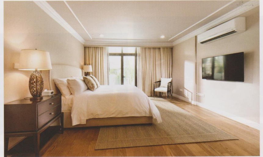
Top and bottom: Modern convenience and old world charm transport the homeowner to simpler times.

the Rice Miller concept is the feel of living within the history that this island is famous for. The whole project is dedicated to the conservation of the old "colonial" style buildings, and the residences as well as all the other buildings have been reconstructed within and around 19th century structures. Simply put, the Rice Miller living concept offers a luxurious lifestyle with a long and rich heritage of peaceful living within a vibrant community.