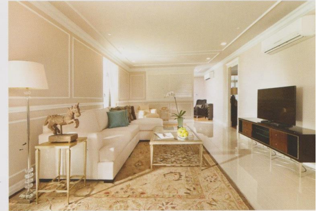
A marriage of old and new: classical European panelled walls provide an elegant backdrop to modern furnishings.