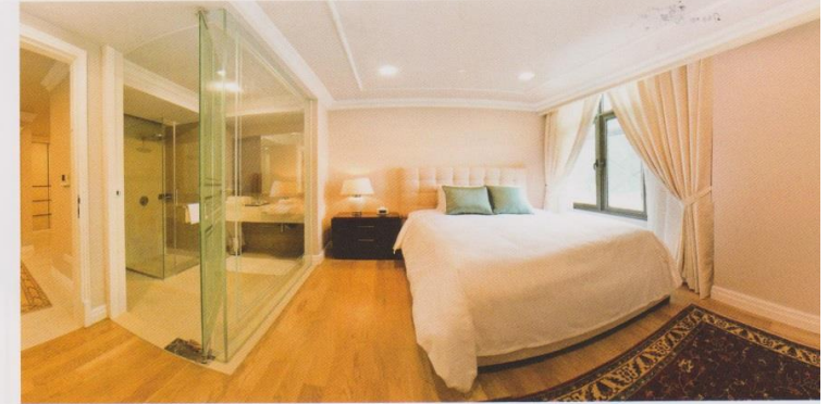
When a bed is this comfortable, waking up to the glorious rays of the morning sun may require a little bit of an effort.