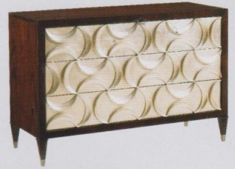
Tie One On Sociables