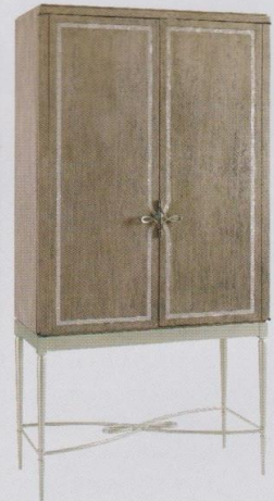
Straight Up With A Twist Crystal Blue Persuasion

Find out more of Caracole collection at Felione Fine Furnishing Gallery (Bangsar):