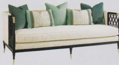
Lattice Entertain You