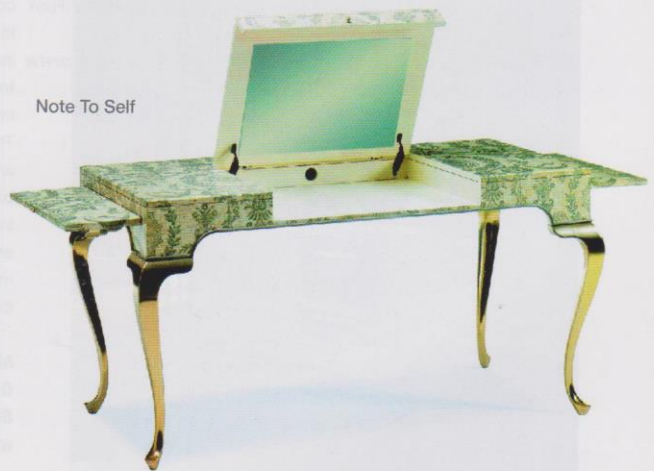
Note To Self

WHERE: Caracole is available at Felione Fine Furnishing Gallery at No 62 & 64, Jalan SS2/24, PJ; 174 Jalan Maarof, Bangsar, KL; and 174-3-4 Jalan Sungai Besi, KL. For more information, call (03) 7873 6968 or log on to www.felionefine.com . ■