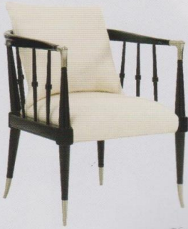
Black Beauty Smoke and Mirrors