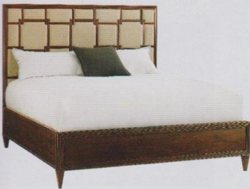
Sleep Pattern Just Wing It